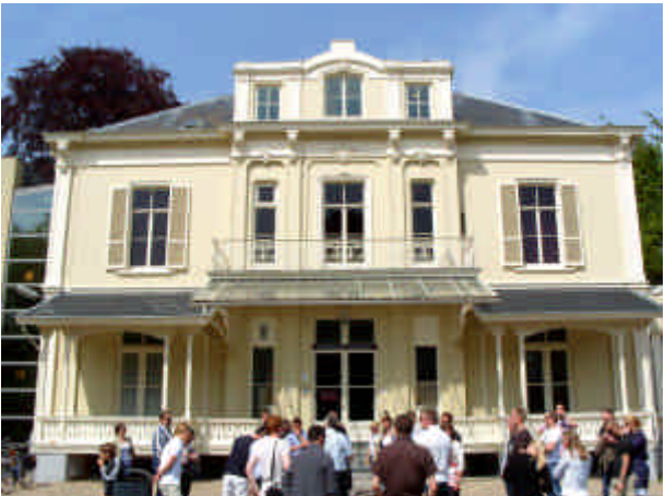
The HQ today