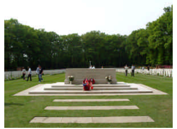
The Airborne War Cemetery